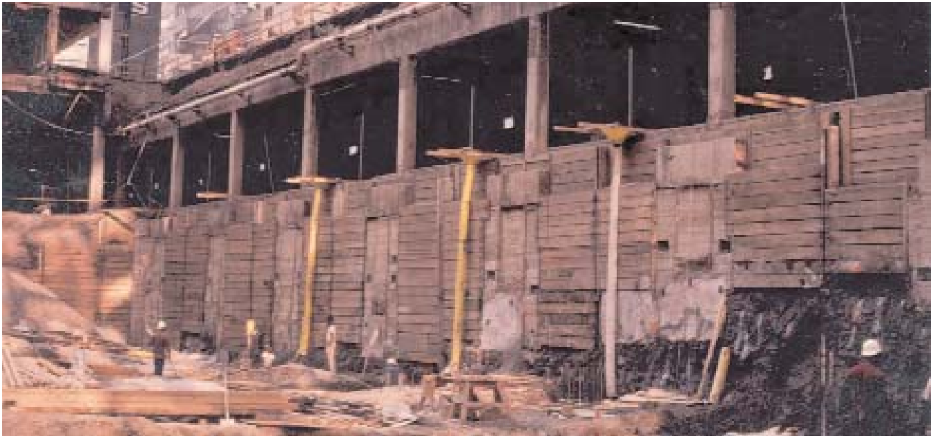
Mellon Bank Corporate Center Philadelphia, PA

To allow foundation construction 50 feet below original grade, Schnabel Foundation Company designed and constructed a tied-back un underpinning and sheeting system to support existing tunnel columns, each loaded with up to 90 kips of roof and traffic loads.